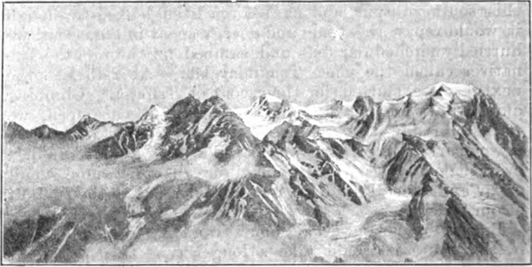
VIEW FROM THE SUMMIT OF TSEORGA, LOOKING TOWARDS THE EAST.

Boerdool in the right foreground, whilst the highest point of Adai Choch is seen under the figure 1, and the top of the double-headed rock peak under the figure 2.